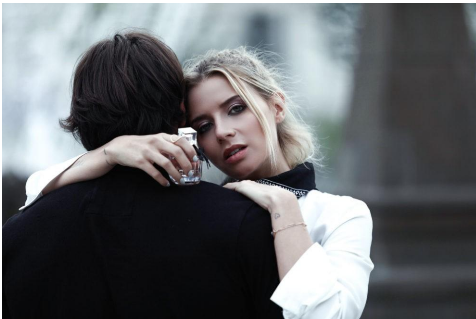
( http://www.thefashionfruit.com/mon-paris-eau-de-toilette/def-ysl-5/ )